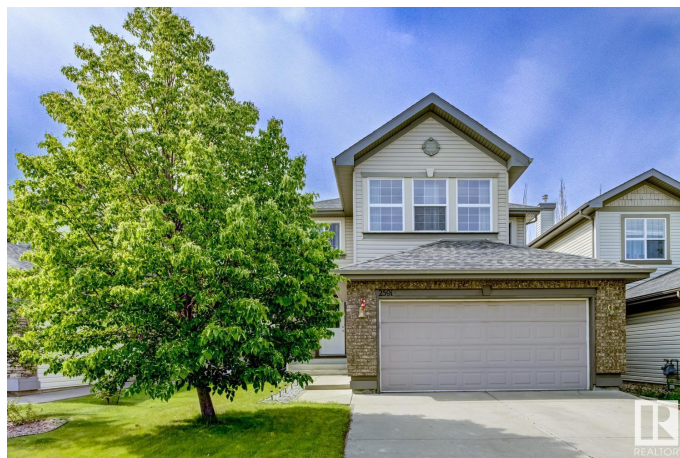
2591 Hanna Crescent NW